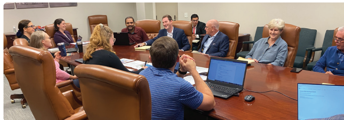
Laurinburg-Maxton Airport representatives meet with NCDOT Aviation staff in September.

A pilot program to host comprehensive annual planning meetings with airport representatives and Airport Development staff at NCDOT Aviation headquarters in Morrisville has met with good reviews and will continue.